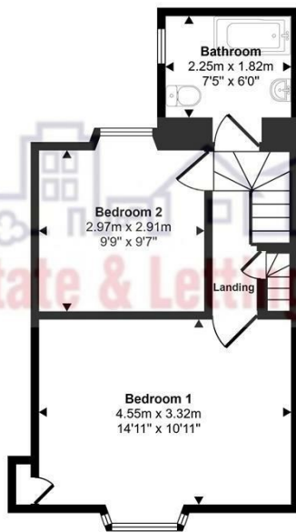
First Floor Approx 35 sq m / 380 sq ft